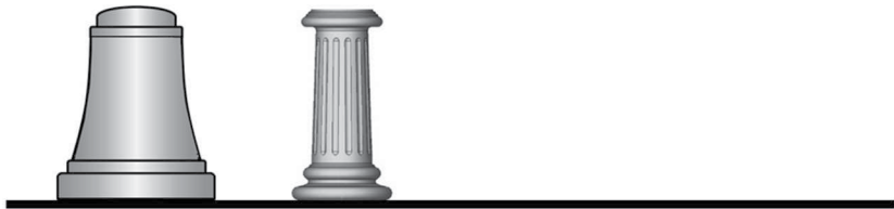
Madison 14.5" Tall 12" Wide Largo 14" Tall 8" Wide