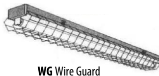
WG Wire Guard